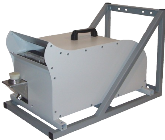
Shown on optional mounting bracket #820062