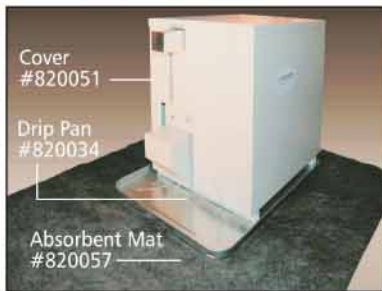
Cover #820051 Drip Pan #820034 Absorbent Mat #820057