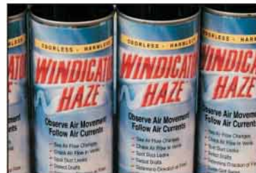
Windicator Haze #820011

Rejex-It® Fluid has an active ingredient called methyl anthranilate, or MA. MA is listed by the United States Food and Drug Administration as a flavoring compound.