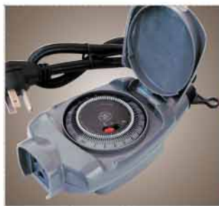
24 Hour Timer with 15 minute adjustments

Ask for the "Double Nozzle" system for heavy infestation areas.