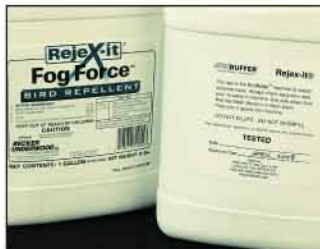
Rejex-it Fluid #840000-B

Rejex-It® Fluid has an active ingredient called methyl anthranilate, or MA. MA is listed by the United States Food and Drug Administration as a flavoring compound.