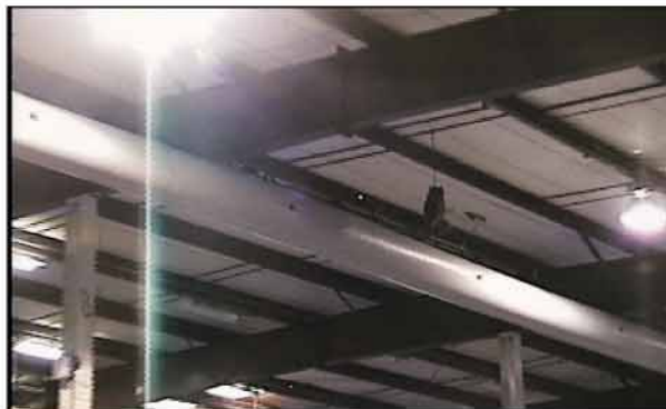
Tubing and Fan Assembly: #810020 ( 200' ) #810030 (over 200')

See air currents with short spurts or a continuous output. You can see the movement of air for best positioning of your Bird Buffer System.